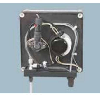
Sample Flow System