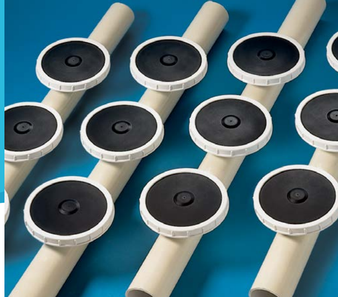
Typical FlexDisc™ installation.

This chart demonstrates the superior oxygen transfer efficiency provided by FlexDisc™ fine bubble diffusers.