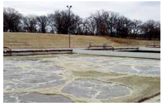
Evoqua's VARI-CANT Jet Mixing Systems are highly energy efficient providing superior mixing rates.