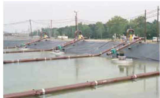
Evoqua's VARI-CANT Jet Mixing Systems are available in a wide range of applications including lagoons.