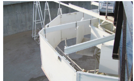
FEDWA Baffle System