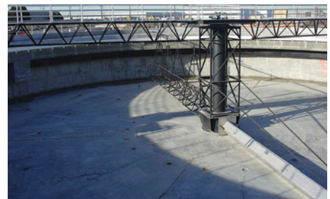
Tow-Bro® Hydraulic Sludge Removal

SCHEDULE YOUR FREE CLARIFIER INSPECTION TODAY! 1-800-524-6324