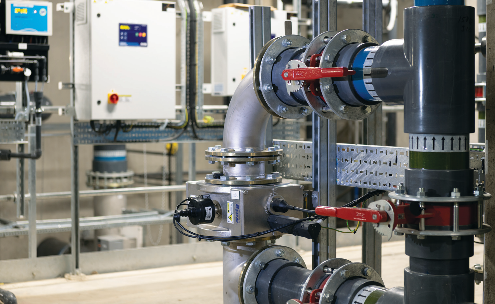
Wafer® UV System installed within a pool plant room.